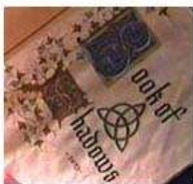
from the "Charmed" TV series

One of the most occultic television shows ever aired is "Charmed". "Charmed" details the spells and occultic practices of three witches. The "NKJV symbol" is the show's primary symbol of witchcraft and is splattered throughout the series. Notice the "NKJV symbol" displayed on "The Book of Shadows". The Book of Shadows is commonly used in witchcraft and satanism: Book of Shadows: Also called a grimoire, this journal kept either by individual witches or satanists or by a coven or group, records the activities of the group and the incantations used.